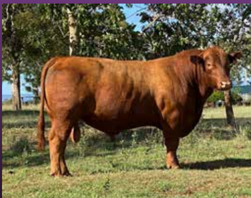
Pictured: Rosemullion Norton

This year all 4 of my bulls are by my Northline Ignition herd sire Rosemullion Norton. Norton was bought out of the Power of Red Sale in 2019 and has matured into a large-framed, powerful sire. His dam is the well-respected & successful Approval show cow Trevone Park Whisper A8. Norton has produced some lovely heifers for me and a great line of bulls for this years' sale.