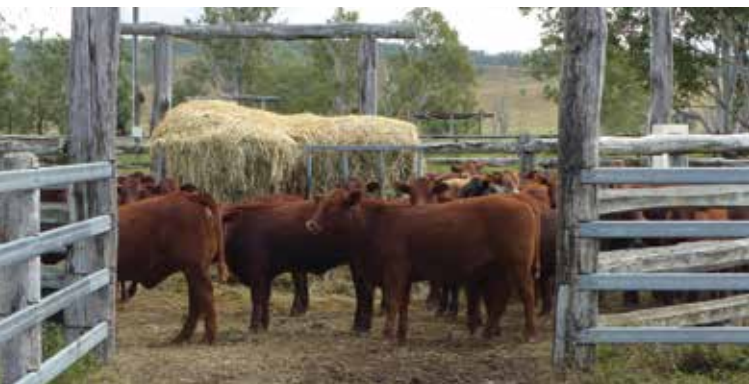
Red Angus cross Bos Indicus weaner heifers