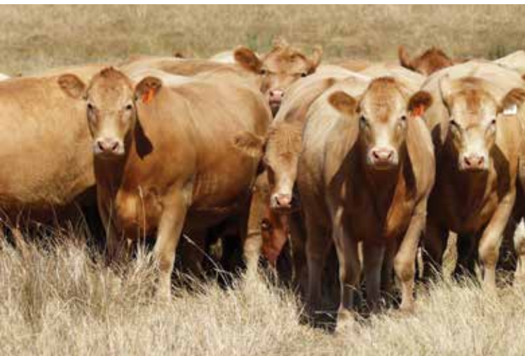
Red Angus cross Charolais heifers